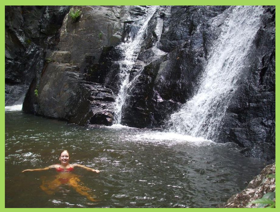
Dinner Falls in the Hypipamee National Park