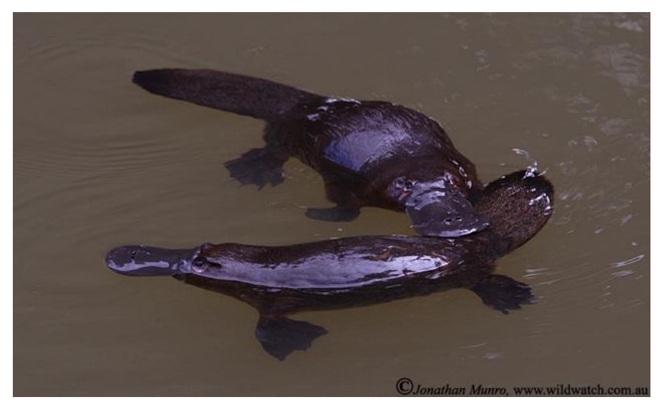
A pair of platypus

As to the second question, Why isn't everyone here already?, the answer is a bit more convoluted. I have a very long answer to that which cannot be consolidated into dot points. But consider the following: