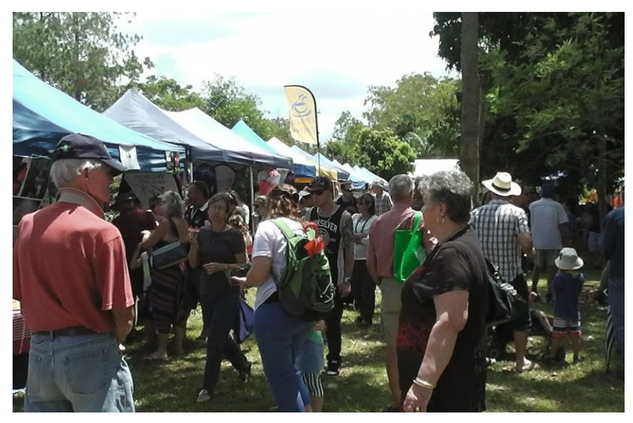
Popular farmers markets and festivals abound