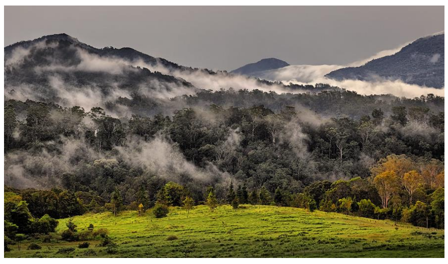
Rainforests of the Atherton Tablelands

So what makes the Tablelands a great place to live and why isn't everyone here already?